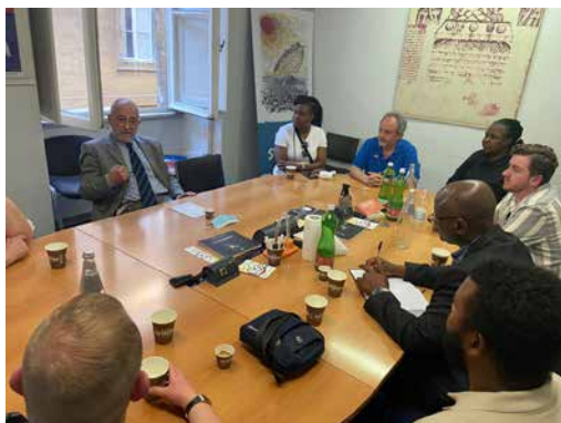
At the Federation of the Protestant Churches in Italy