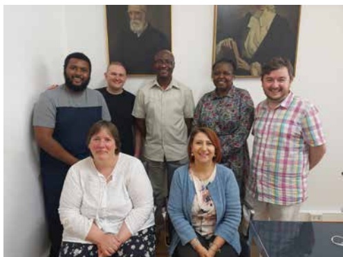
At the Methodist headquarters.