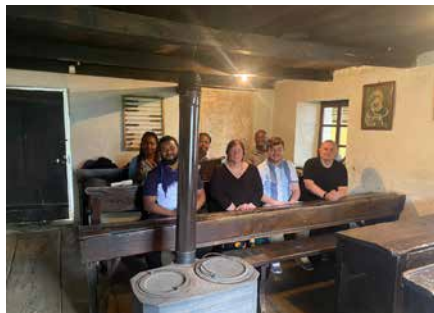
A history lesson at Scuola Beckwith.